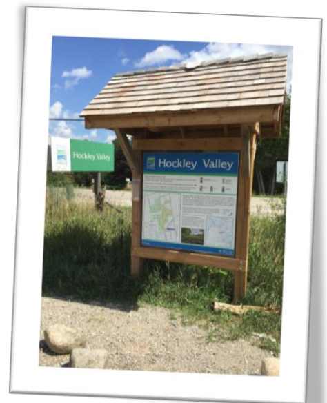
Photo: Hockley Valley Nature Reserve Trailhead Sign