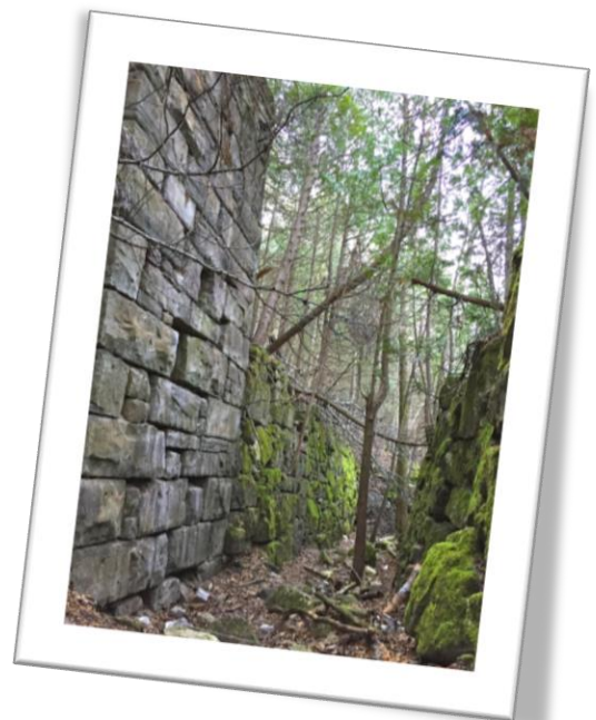
Photo: Hoffman Ring Kiln Ruins

Departing the main Trail as you descend the scarp face of Devil's Pulpit, the Ring Kiln Side Trail follows a series of old rail beds westward to the impressive ruins of a Hoffman Lime Kiln. Be sure to take time to visit the interpretive plaque located at the ruins, which explains the site's history and significance.