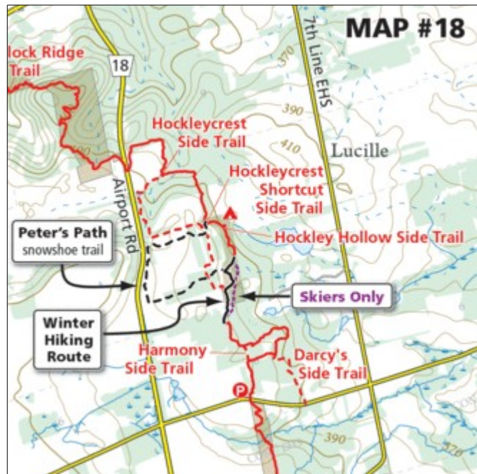
Map 18 - Caledon Hills - Temporary (Seasonal) reroute

A portion of the main trail is closed to hikers and snowshoers, but remains open for the exclusive use of cross-country skiers.